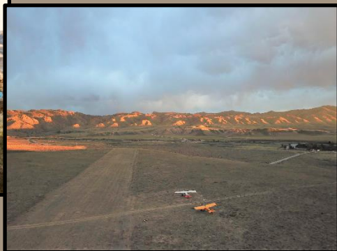
1 st Wyoming RAF Strip: Miracle Mile